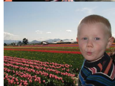
We went to see the tulips!